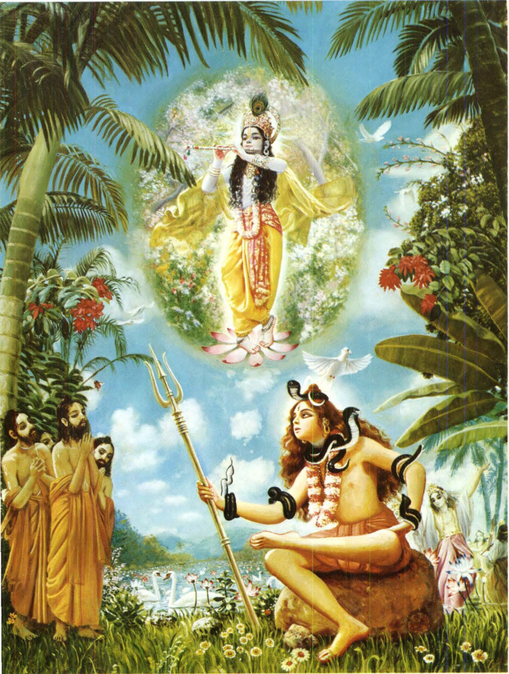
Plate 4 Lord Śiva addressed the Supreme Personality of Godhead with his prayer. (p. 1063)