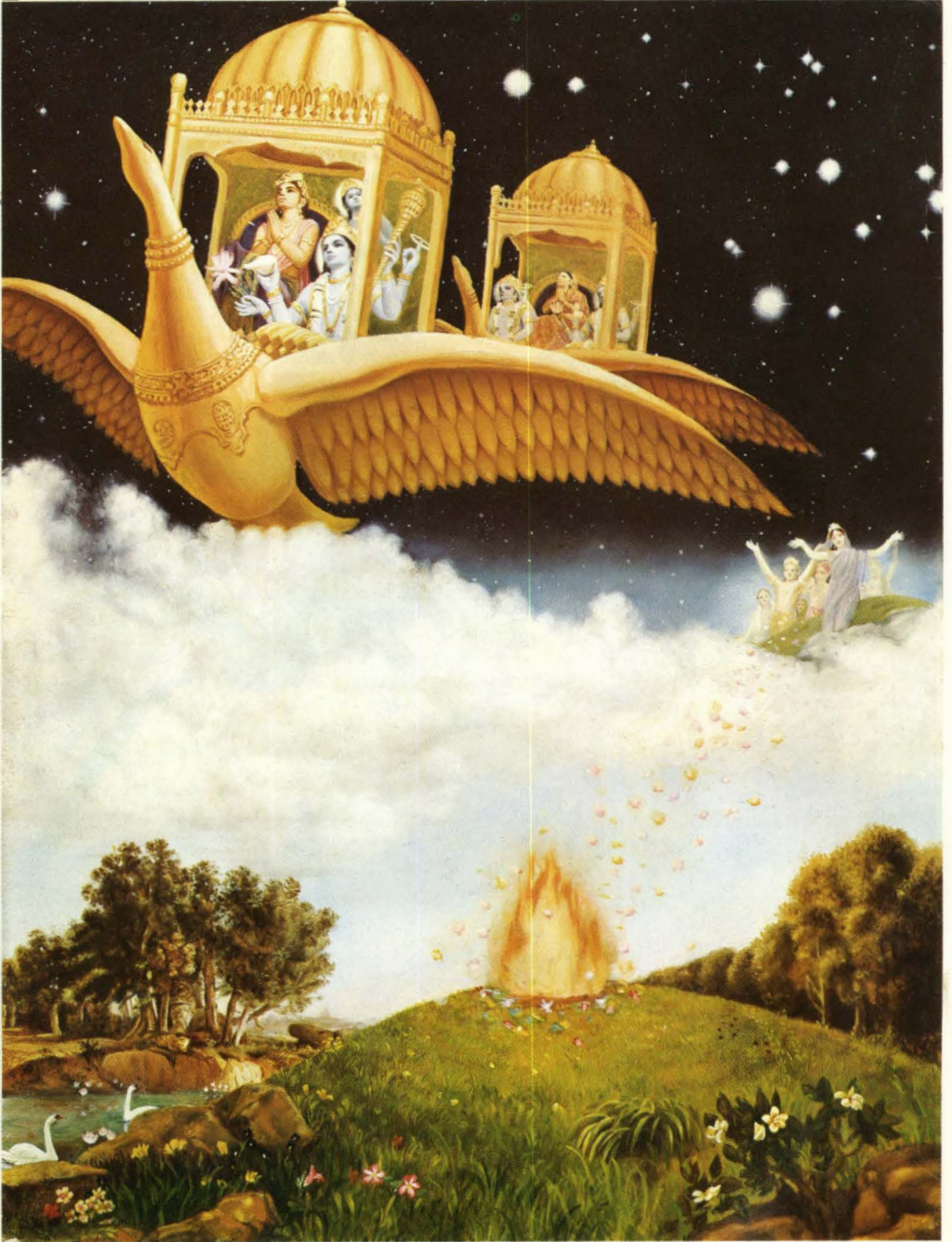
Plate 3 "Just see how this chaste lady, Arci, is still following her husband upwards, as far as we can see." (p. 1007)