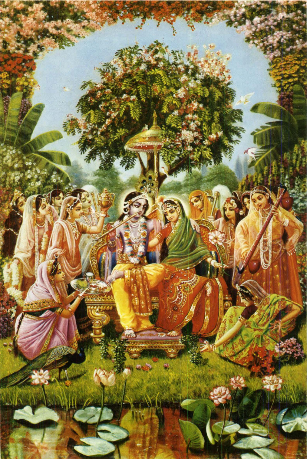
Plate 6 The Lord is superexcellently beautiful on account of His open and merciful smile and His sidelong glance upon His devotees. (p. 1085)