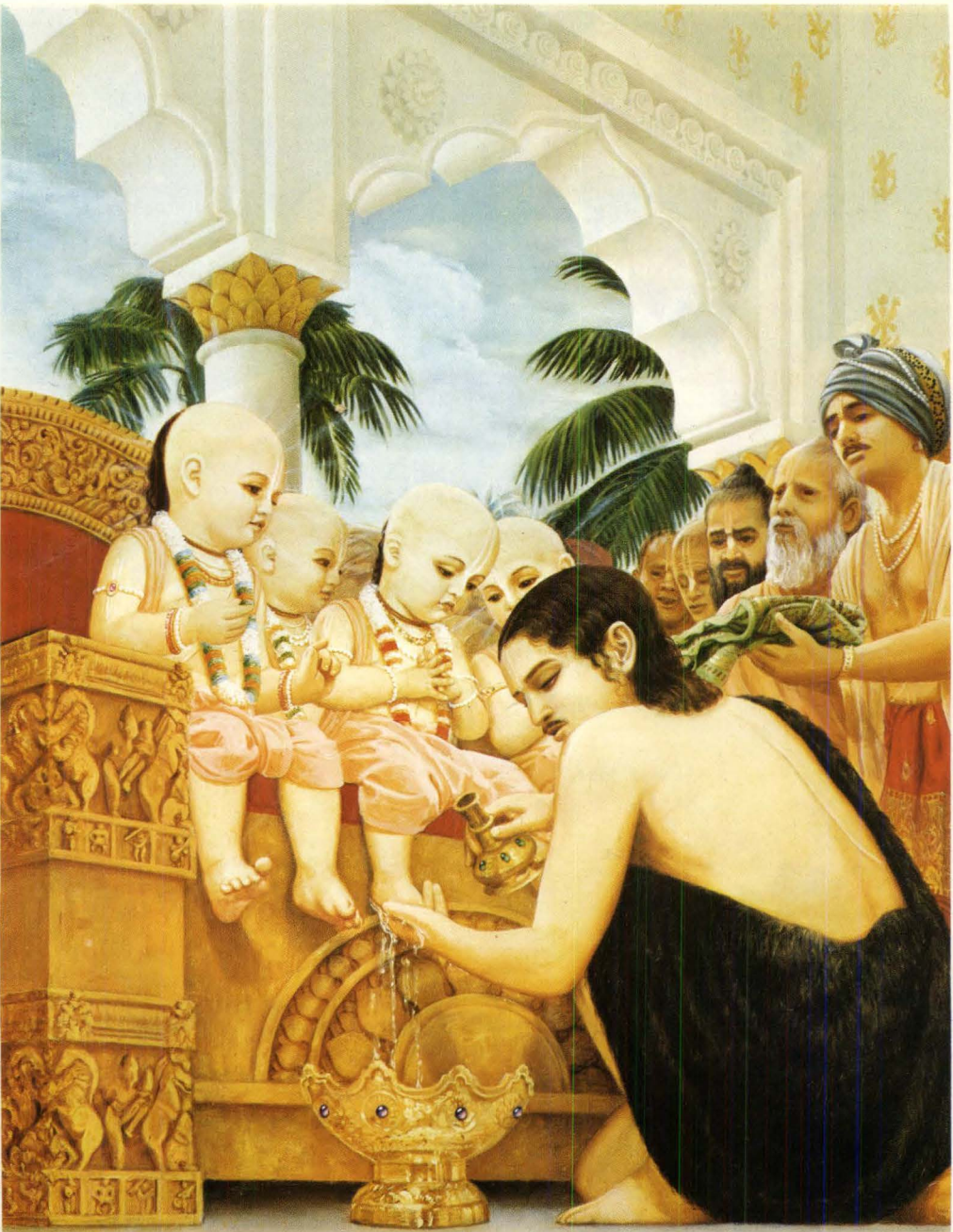
Plate 2 The King took the water which had washed the lotus feet of the Kumāras and sprinkled it over his hair. (p. 891)