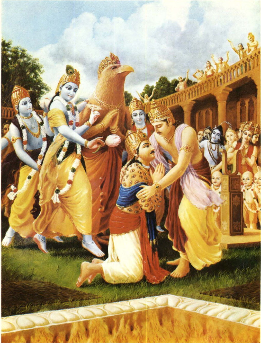
Plate 1 Ashamed of his activities, King Indra fell down to touch the lotus feet of Pṛthu Mahārāja. (p. 787)