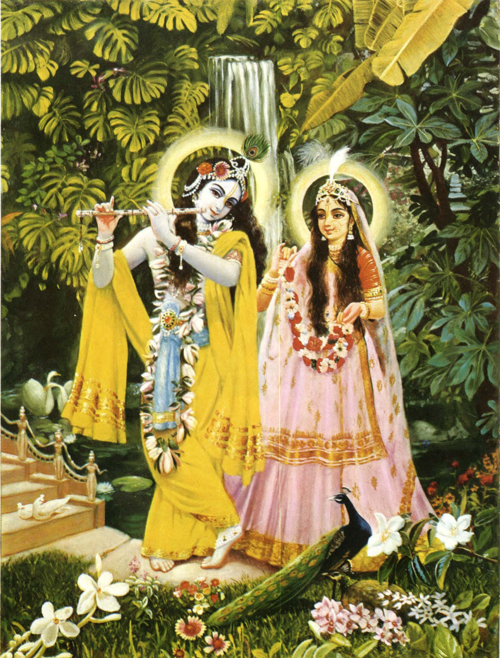
Plate 7 "My dear Lord, those who desire to purify their existence must always engage in the meditation of Your lotus feet." (p. 1091)